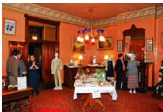
Sample Room I now "This Little Souvenir" Museum Shop

shelves again full of authentic bottled and canned goods from the turn of the 19th century, The massive furnace appears to be in use, and the workbench-area opposite, displays repair projects in progress.